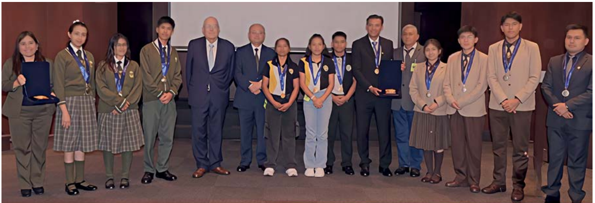
BCRP authorities with winners of the School Contest, 2024

The students of the Educational Institution 60113-Rumococha of Maynas, Loreto, were the winners of the XVII BCRP School Video Contest for the video “Let’s take care of the monetary stability”, which highlighted the role and autonomy of the BCRP. Second place was awarded to the students of San Antonio de Huamanga School, Ayacucho, for the video “Importance of the BCRP’s Autonomy through the years”. Finally, the team from the Educational Institution 80892-Los Pinos de Trujillo, La Libertad, won third place with the video “The Autonomy of the Central Bank, backbone of a country’s economy”. The winning videos were disseminated on the BCRP’s social networks.