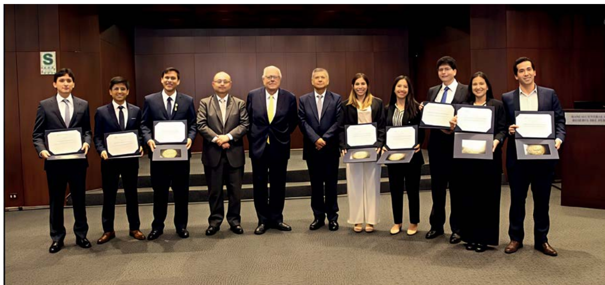
President Julio Velarde with officers and contest winners.