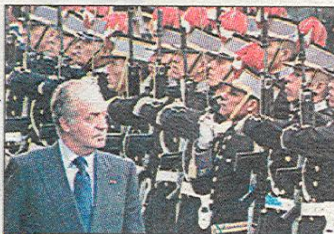
Rey disfrutó de los puros

Bush aparentemente disfrutó esos puros ya que la Casa Blanca envió al gobierno peruano una carta agradeciendo por los cigarros. El